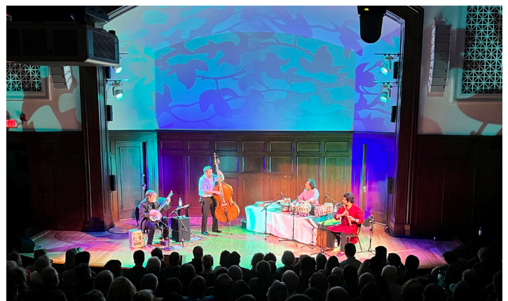
Béla Fleck | The Sheldon | 2023