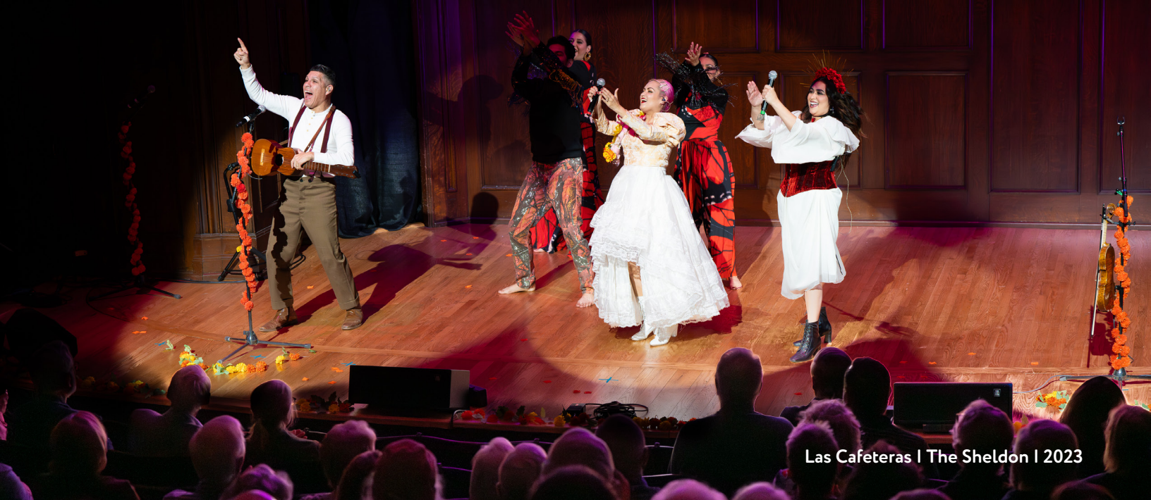
Las Cafeteras | The Sheldon | 2023