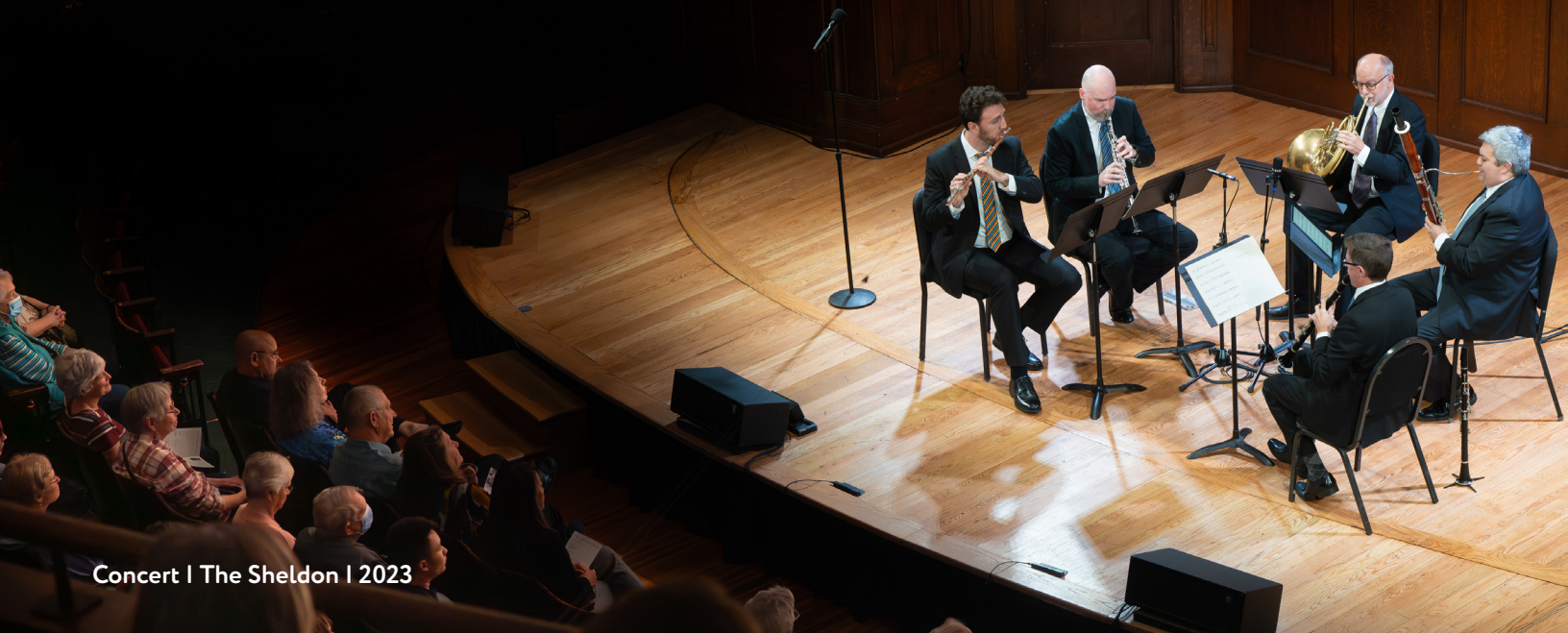
Concert | The Sheldon | 2023