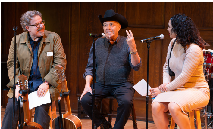
Pre-Show Curtain Talk | The Sheldon | 2024