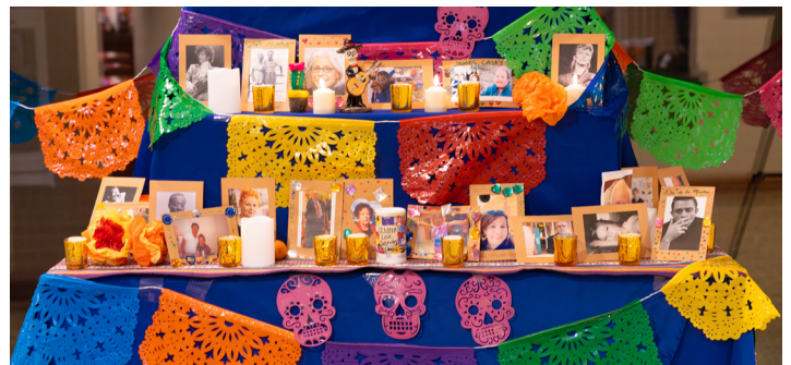
Community Ofrenda | The Sheldon | 2023