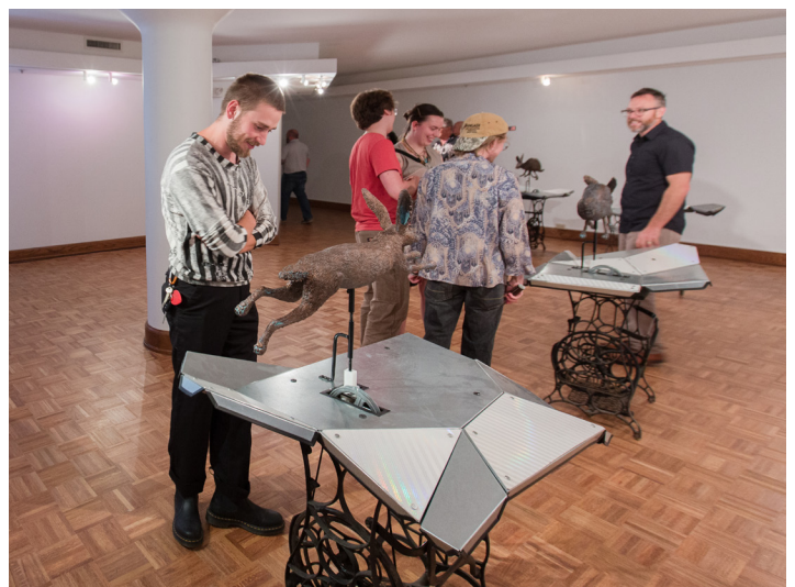
Fall Gallery Opening | The Sheldon | 2023